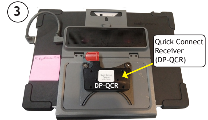
Slide the DP-QCR onto the Quick Release Adapter Plate until it "clicks" and locks in place.