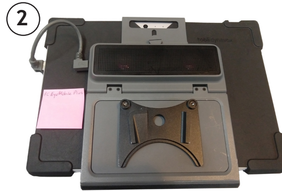
Attach Tobii's Quick Release Adapter Plate to the back of the case with the provided screws.