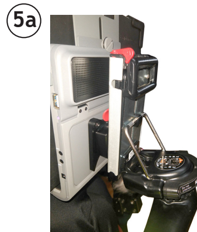
Attach the QRP to the Tilt Plate on the Mount'n Mover arm.