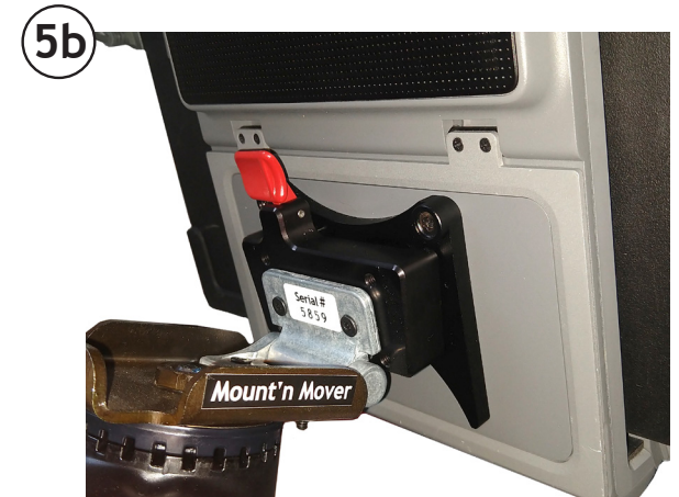
If your Mount'n Mover has the Quick Connect Receiver (DP-QCR) instead of the Tilt Plate you can attach directly to Tobii's Quick Release Adapter Plate.