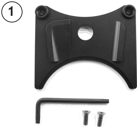
Tobii Dynavox's Quick Release Adapter Plate for I-110 and EyeMobile Plus. Comes in the box but is not attached