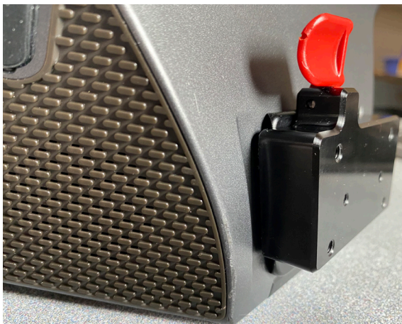
Quick Connect Receiver attached to Tobii Mounting Bracket