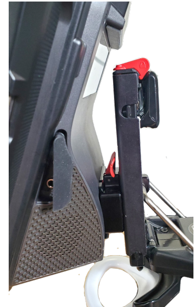
Tobii TD Pilot mounted correctly.