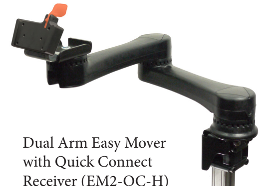
Dual Arm Easy Mover with Quick Connect Receiver (EM2-QC-H)