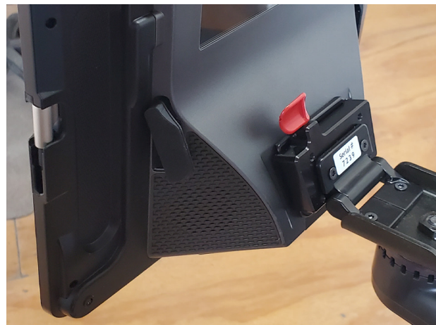
Tobii TD Pilot mounted to a Dual Arm Easy Mover with Quick Connect Receiver.