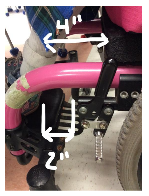
4 " of tubing from front of seat to foot hanger, 2" of pink tubing from front of black brake tube to foot hanger. When brake is on there is an 1 \frac{1}{2} " gab between brake and pink tubing.